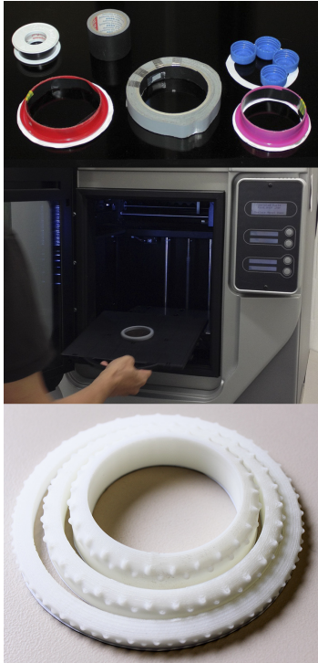
Figure 2: Prototyping with real-world objects and final ring tangibles.

of our application make use of this idea and it furthermore demonstrates the ability to nest multiple tangibles.