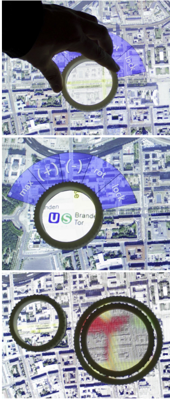
Figure 4: Opacity, zoom factor, and traffic density plus heat map controlled by TangibleRings.

elements: ring markers to identify radius and position, and ID markers to retrieve ID and orientation. The ring markers are positioned face to face, providing us diameter and center of the ring. In combination with the positions of the ID markers, we are able to distinguish and identify multiple and nested rings. The relative positions of the ID markers to the center of the rings and their asymmetric design let us determine the unique orientation of the ring. In the end, our detection is robust enough to scale with an arbitrary number of concentric rings, though we think that more than two or three concentric rings would not be very useful or user friendly.