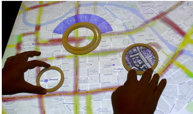
Figure 1: TangibleRings in a map application, each controlling different information layers.